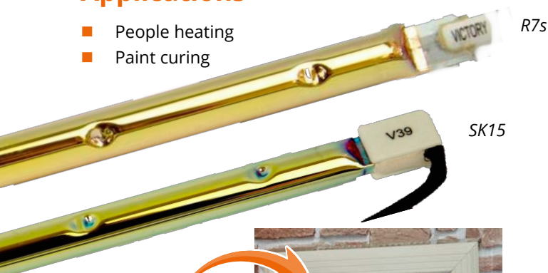
Low Glare Gold lamp